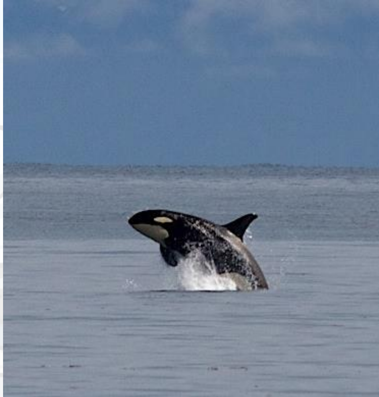
orca (killer whale)