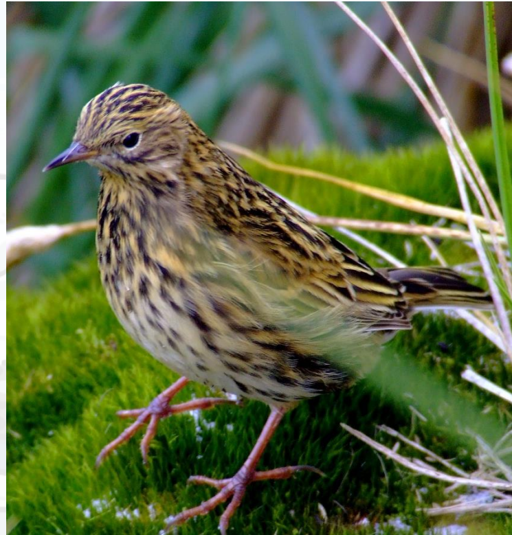
South Georgia pipit