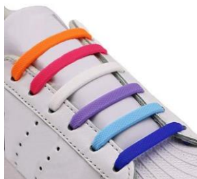
No tie laces