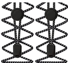
Elastic lock laces