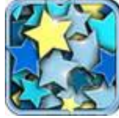
Drawing with Stars