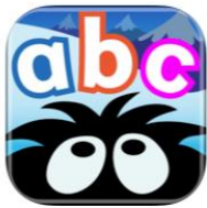
Hairy Letters Sentences