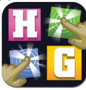
Target and Touch: Hidden Grid