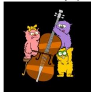
Target and Touch: Musicians